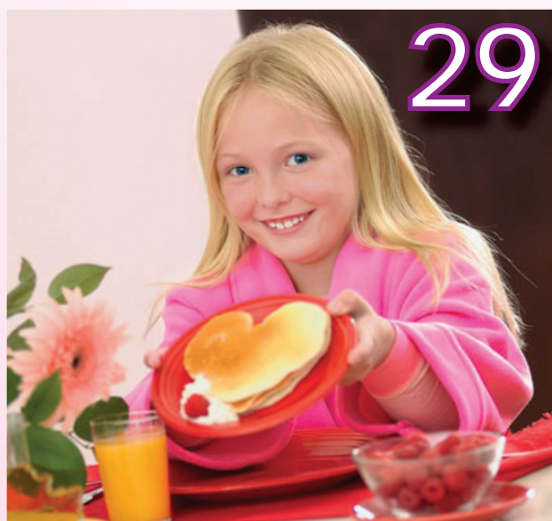
Heartfelt Pancakes