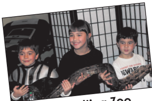
Small Petting Zoo By Animal Quest