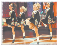
Trinity Irish Dancers