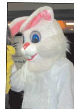
The Easter Bunny!