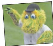
Chicago White Sox Southpaw