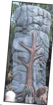
Climbing Wall from TheFunOnes.com