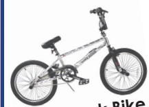
Tony Hawk Bike