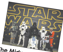
The Midwest Garrison